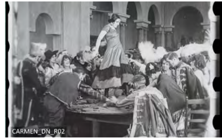
Duplicate produced in West Germany in the 1970s, from the holdings of the Bundesarchiv Filmarchiv

The movie premiered on December 20, 1918 at Berlin’s Union Theater on Kurfürstendamm. A few weeks earlier, on November 8, 1918, press and Ufa executives had been treated to an exclusive preview of the film while Lubitsch was still working on the final cut. Pola Negri later recounted that the November Revolution raged in the streets of Berlin that evening, and the screening kept being punctuated by the distant sound of rifle fire. On November 9, 1918, the day after the advance screening, the Weimar Republic was proclaimed.