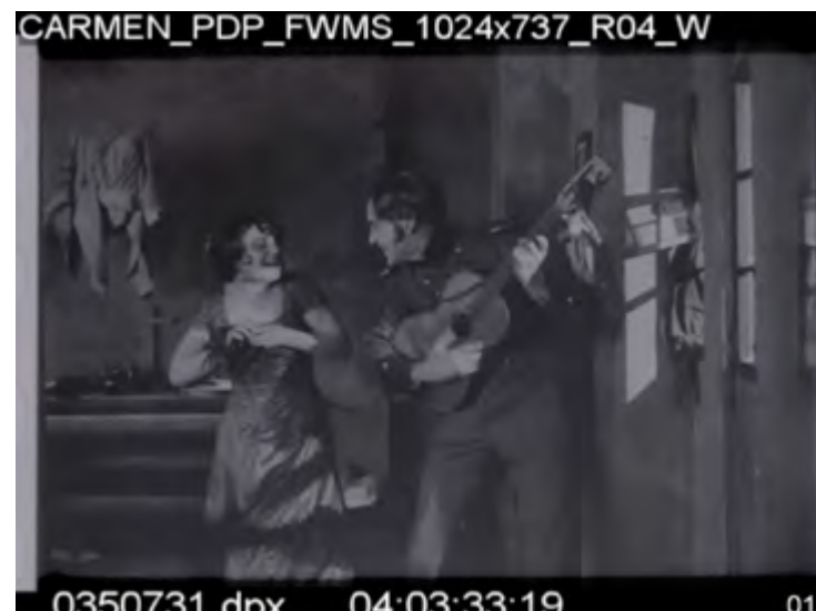
Film still from the Soviet material

Two black-and-white duplicates, one of Soviet manufacture with working notes incised, now stored in the German Federal Archives, and another of later generation from the same stock, served as the source and basis. Together with the copy fragments, these two materials were digitized in 4K at L'Immagine Ritrovata in Bologna and combined into a largely