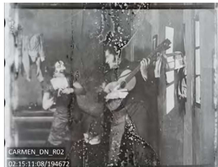
Duplicate produced in West Germany, from the holdings of the Bundesarchiv Filmarchiv