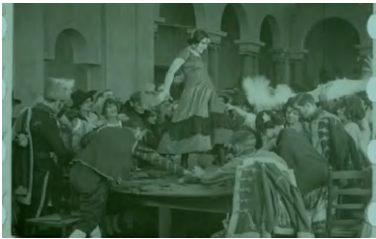
One of the surviving fragments from the historic distribution copy

stock into a variety of dye baths (“tinting”). According to a convention that had already established itself as part of a canonical film language by the time CARMEN was produced in the late 1910s, each nuance was ascribed its own meaning. If decay or disintegration is the “best case scenario” for the inexorable aging of cellulose nitrate film material, the most common scenario is a more drastic and irreversible one: it self-ignites and burns (spontaneous combustion). This is precisely the reason why so few of the films of the past – especially from before World War II – have survived. And this is precisely why it is such a great sensation whenever one is rediscovered.