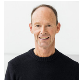
Thomas Rabe Chairman and Chief Executive Officer of Bertelsmann and Chief Executive Officer of RTL Group