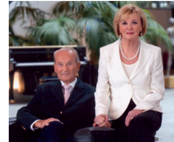
Reinhard and Liz Mohn